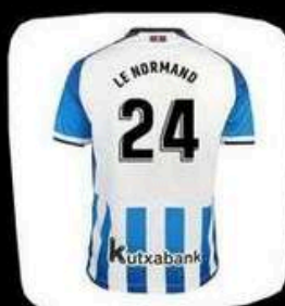
Robin Le Normand