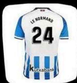
Robin Le Normand