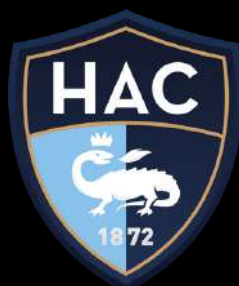
Le Havre AC